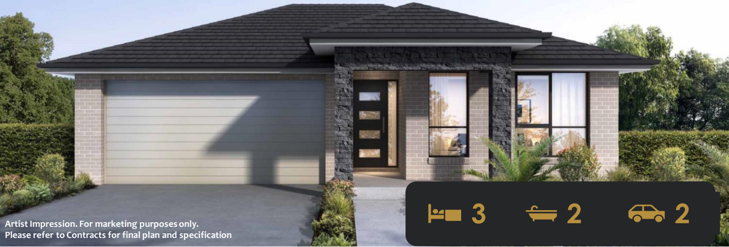
Artist Impression. For marketing purposes only. Please refer to Contracts for final plan and specification